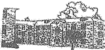
Martin House, Inc.